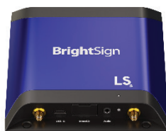
HD Basic I/O Package