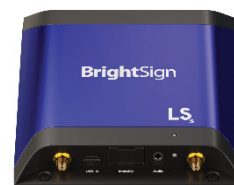
4K Basic I/O Package